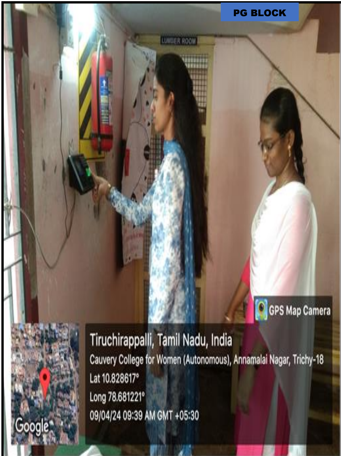
HOSTEL - PG BLOCK