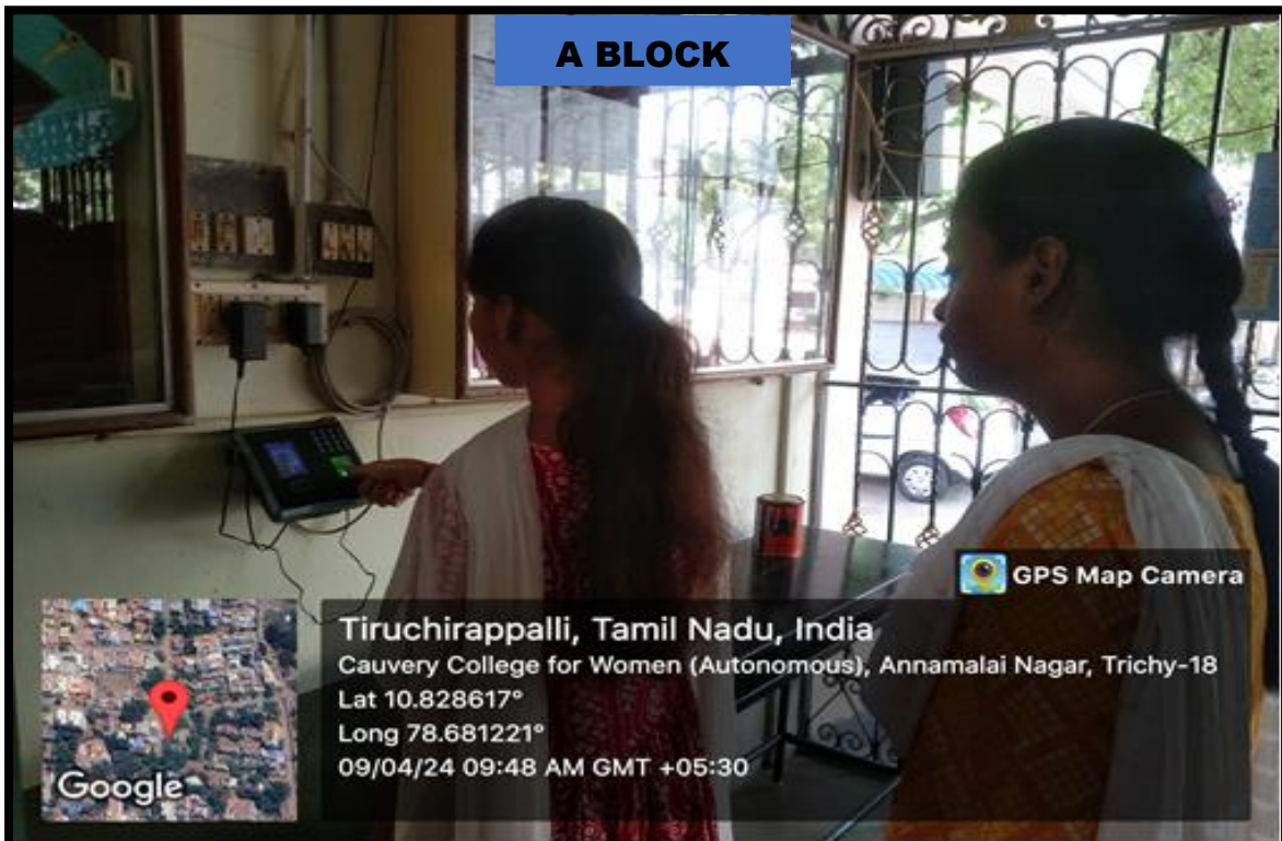
HOSTEL - A BLOCK