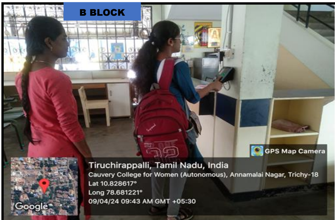
HOSTEL - B BLOCK