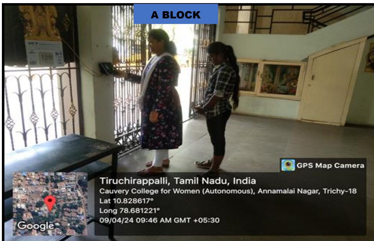
HOSTEL - A BLOCK

Implementing a student biometric system in hostel ensures secure and efficient monitoring of students' movements. Parents can be reassured of their child's safety as the system accurately records entry and exit times. This technology enhances hostel security by preventing unauthorized access. In case of emergencies or unexcepted absences, administrators can quickly identify students' whereabouts. Moreover, it streamlines administrative tasks, reducing manual attendance tracking. This biometric system promotes transparency and accountability, fostering a safe and conducive environment for students' academic and personal growth.